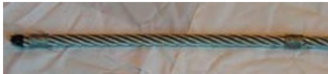
Seizing wire mounted at the end and on the wire