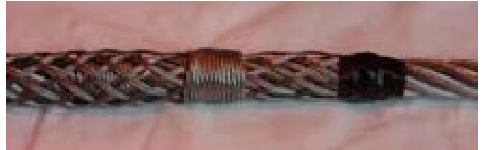
Tape the end so it does not open