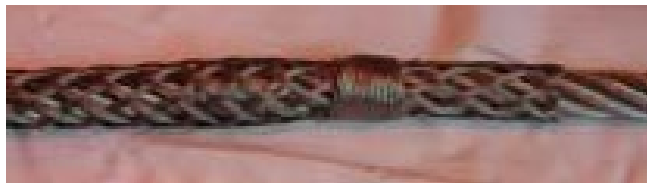
Installation of safety seizing wire outside