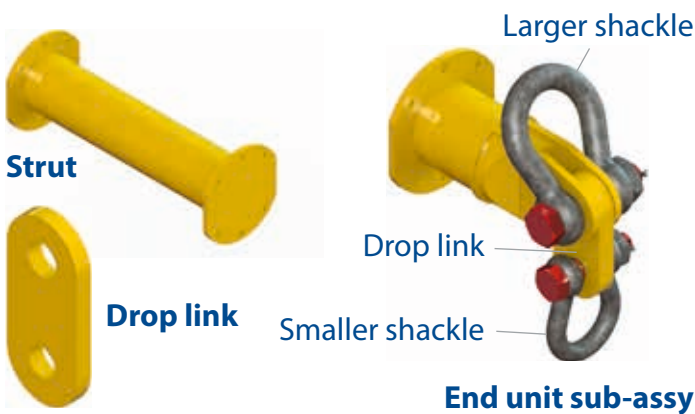
Table 1 – Component List