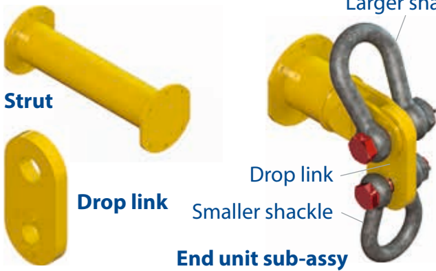
Table 1 – Component List